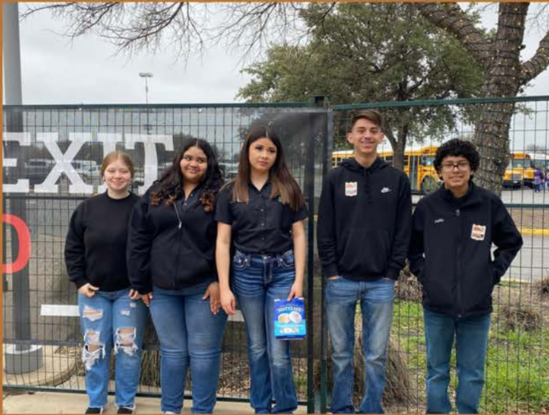
PEARSALL 4-H CLUB