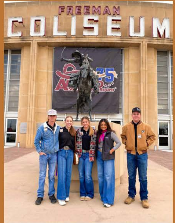
MAVERICKS 4-H CLUB