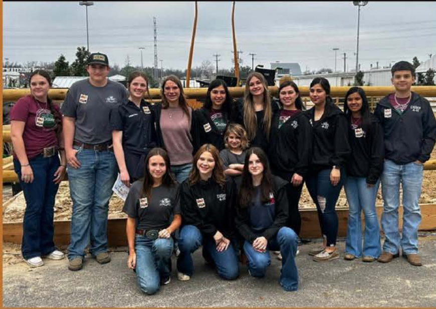
DILLEY 4-H CLUB