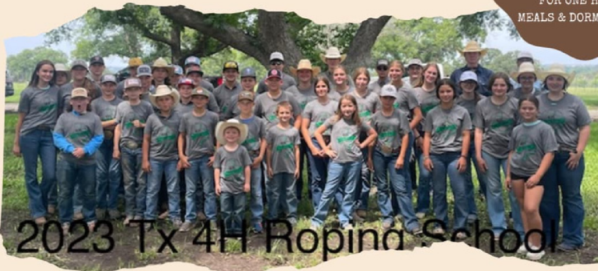
2023 Tx 4H Roping School

INCLUDES SCHOOL, GROUP INSURANCE, STALL RENT FOR ONE HORSE, MEALS & DORM LODGING